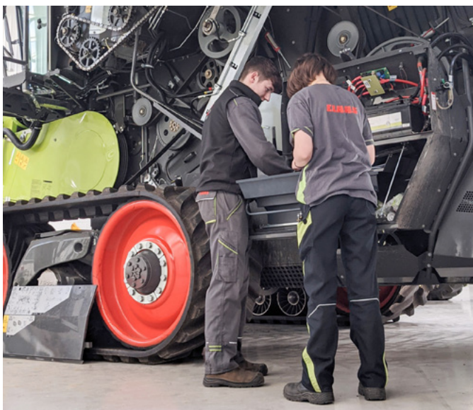
Above: First year CUK Apprentices getting to grips with some of the kit in the CLAAS UK Academy. Below: some of our Apprentices relaxing in the break-out area.