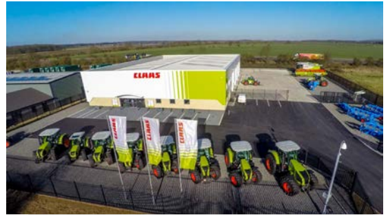
CLAAS UK own 4 of 15 key CLAAS dealerships across the UK and Ireland covering 63 branch locations