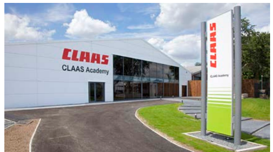
New state of the art CLAAS Academy designed to provide industry leading training