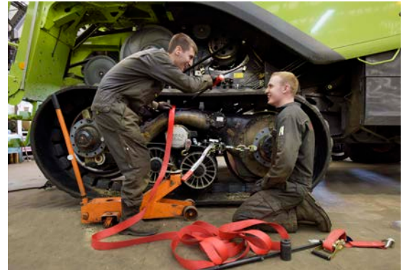
Receive hands-on experience in CLAAS dealer workshops