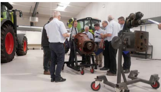
Over 6,000 people, who service and sell our machines, are trained by the CLAAS Central Academy each year