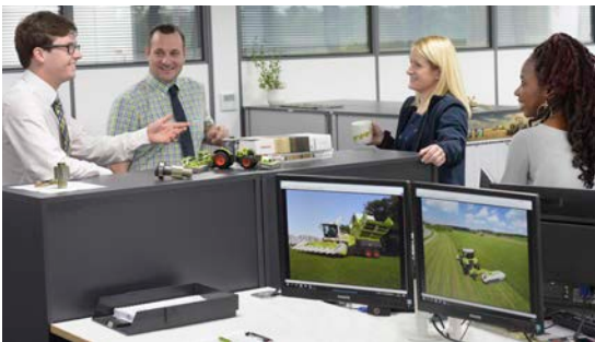
11,356 people employed worldwide including over 700 trainees within the CLAAS network