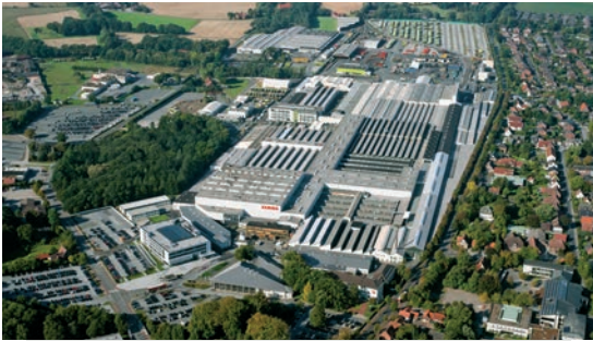
11 factories around the world