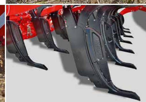
ULD+ points loosen the soil deeply and even in heavy soils, do not bring large clods to the surface.